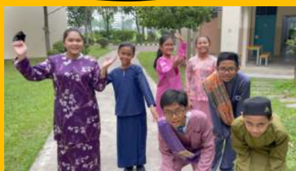
The graduating Malay Language students came together and made a memorable rendition of the Hari Raya song, 'Balik Kampung'.