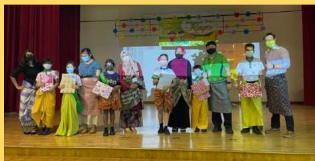
Teachers and students took part in a game where they had to fashion the samping for each other. Their walks and poses wowed the audience as everyone cheered for them.