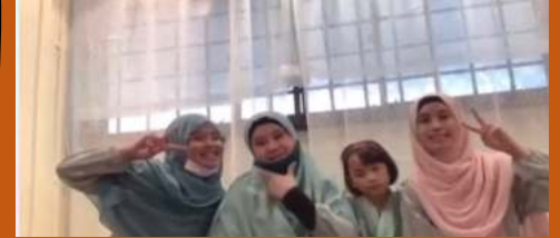
Special thanks to the Parent Support Group (PSG) who played a key role as they enlightened us on the customs and traditions of Hari Raya Aidilfitri.