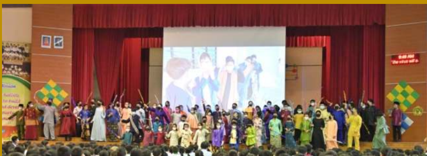
The P3 and P6 students marched in during the finale and filled up the stage as they sang the song 'Balik Kampung'. This song was aptly sung to celebrate families who might have finally reunited with their loved ones from across the borders. The hall echoed with happy voices who sang along to the catchy chorus!